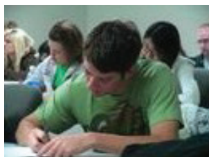
Photo from First Day of Class suite of stories

The MERLOT ELIXR Initiative is a multimedia case story repository that features discipline-specific stories of faculty engaged in exemplary teaching practices. All the case stories are brief, applied, and focus on a particular teaching strategy and offer faculty vignettes, course artifacts and interactive resources.